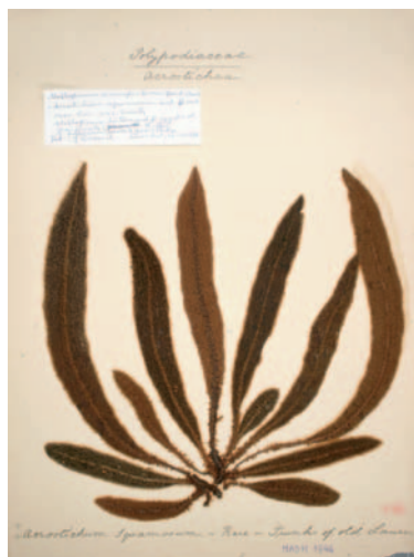
Fig. 4 - Elaphoglossum semicylindricum (T. E. Bowdich) Benl (MADM No. 1846).