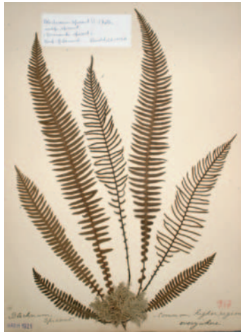
Fig. 5 - Blechnum spicant (L.) Roth subsp. spicant (MADM No. 1821).

Pteridium aquilinum (L.) Kuhn subsp. aquilinum [MADM No. 1820]