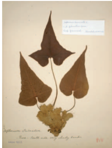
Fig. 3 - Asplenium hemionitis L. (MADM No. 1823).