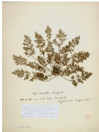
Fig. 6 - Cheilanthes guanchica Bolle (MADM No. 1813).